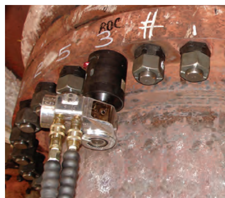
The hands-free HYTORC Avanti™.

THE HYTORC WASHER™ IS JUST ONE OF MANY HYTORC INNOVATIONS DESIGNED TO MAKE BOLTING SAFER AND SIMPLER.