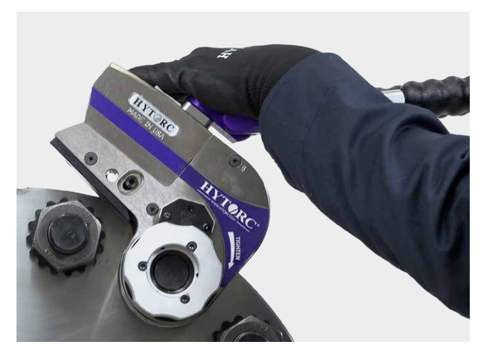
Position the link over the nut and washer. Make sure the link is fully engaged on the hardware and tighten to Specification.