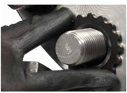
Verify that the nut will run free by hand onto the bolt on the front of the flange.