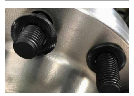
Install the HYTORC Backup Washer over the bolt on the rear of the flange.