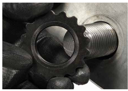
Ensure the HYTORC J-Washer is installed with the beveled side containing outer knurl ridge faces the flange and the flat side containing inner knurled ridge faces the nut.