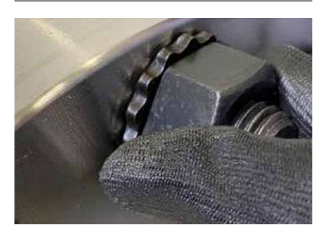
Tighten the nut by hand until snug.

IMPORTANT! DO NOT APPLY LUBRICATION ON THE FLANGE OR THE BEVELED SIDE OF THE WASHER OR THE WASHER WILL NOT PROVIDE THE REACTION FUNCTION.