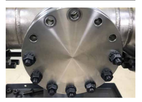
Align flanges per PCC-1 requirements and ensure fastener surfaces are free of defects.