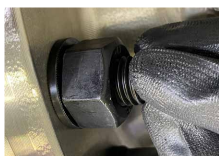
Install the back nut onto the bolt on the rear of the flange and tighten by hand until snug.