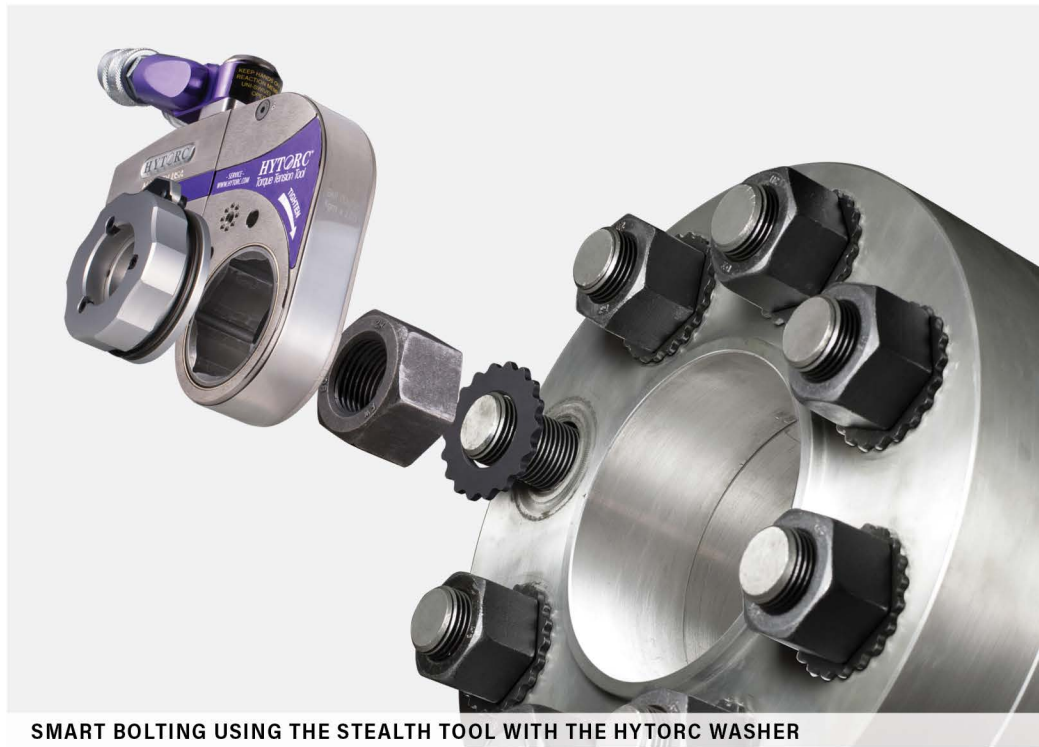
SMART BOLTING USING THE STEALTH TOOL WITH THE HYTORC WASHER

HYTORC's mission is to optimize safety, quality and schedule in industrial bolting through smart technology, innovative solutions, and an unyielding commitment to world-class customer service.