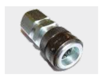
Self-sealing quick-connect coupling.