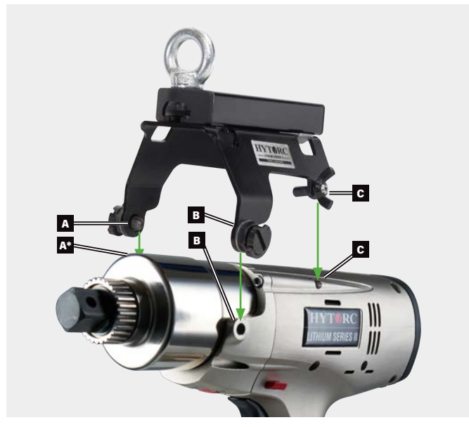
The LST Tool Hanger mounts onto three fastening points (A), (B), and (C) to safely and securely fit all models and sizes of the LITHIUM SERIES® II Tool.