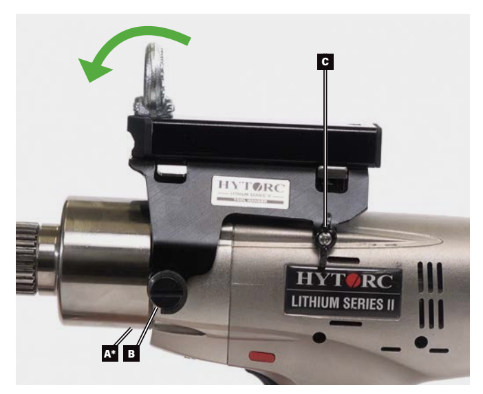
STEP 2: Pivot down the LST Tool Hanger so captive screws (A) and (B) align with the tapped holes on both sides of the tool. Hand-tighten both captive screws and the wing nut on locating pin (C) until fully secured. adjust the sliding beam (E) to the desired position. Take caution not to cross threads.