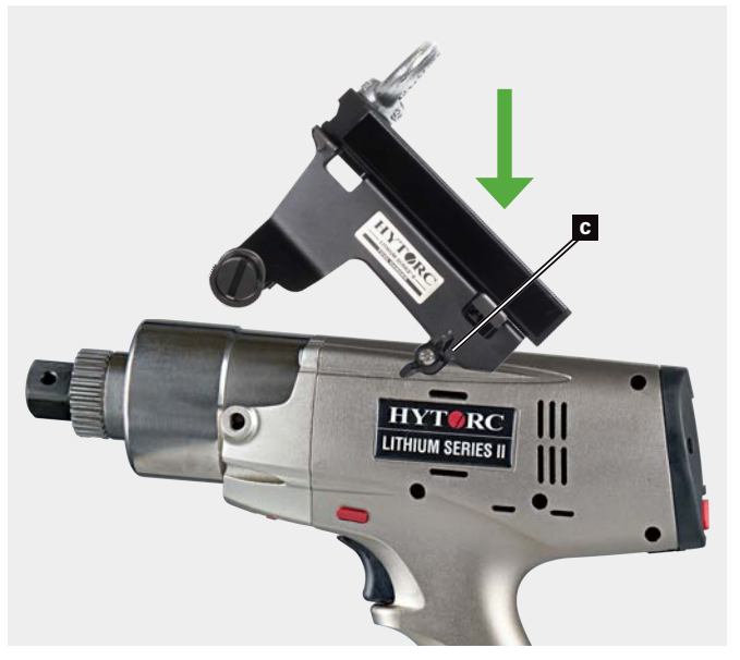
STEP 1: Position the LST Tool Hanger over the tool as shown. Align locating pin (C) with the tool's insert hole. Slide locating pin firmly into hole.