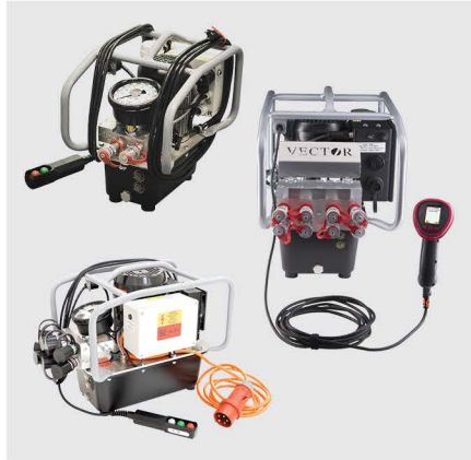
Hydraulic Pumps (Clockwise from top): JETPRO 18.3 SA VECTOR FA-DOC JETPRO S ATEX-Certified (optional, not shown)