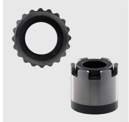
Fasteners (Top to bottom): HYTORC Washer HYTORC Nut