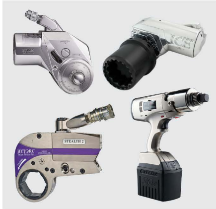
Torque Tools (Clockwise from top): AVANTI ® Hydraulic Torque Wrench ICE ® Hydraulic Torque Wrench STEALTH ® Hydraulic Torque Wrench LITHIUM SERIES ® II Electric Torque Tool